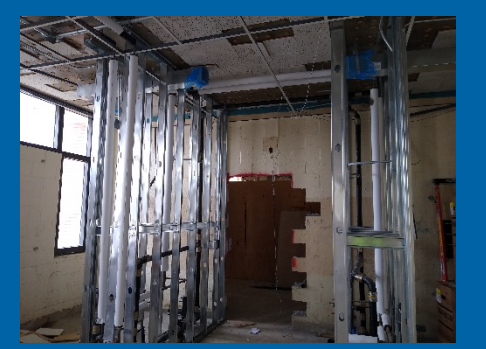
Installation of Overhead Pipes and Pipe Insulation in Building 2010