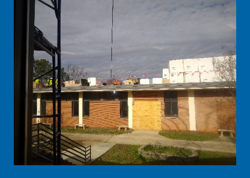
Continue Demolition and Replacement of Roof